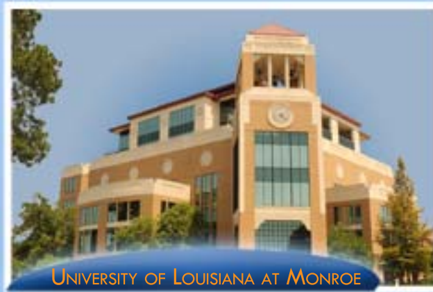
UNIVERSITY OF LOUISIANA AT MONROE