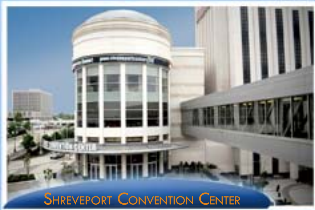
SHREVEPORT CONVENTION CENTER