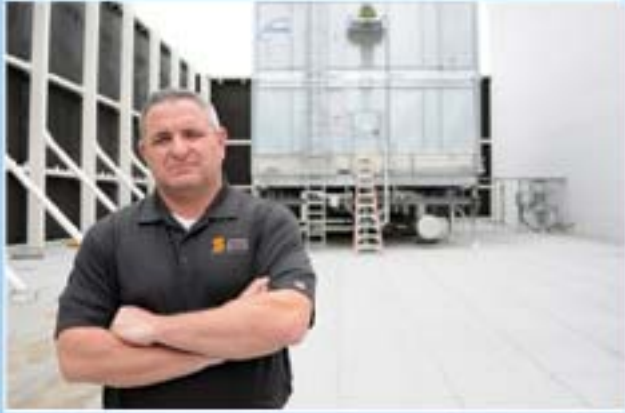
Shreveport Convention Center