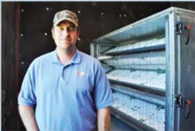
Delta Community College