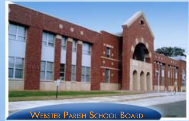
WEBSTER PARISH SCHOOL BOARD